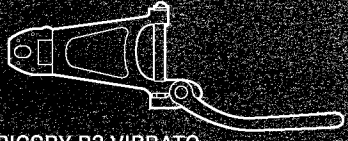
BIGSBY B3 VIBRATO