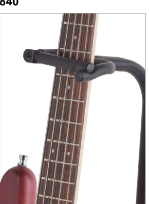
For one Electric or Acoustic Guitar or Bass (available with Locking System or Automatic Flip System)